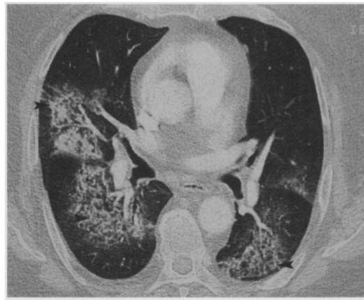
Fig 2 Computed tomography of the chest confirming bilateral air space infiltrates (arrowheads) and surrounding ground glass shadowing